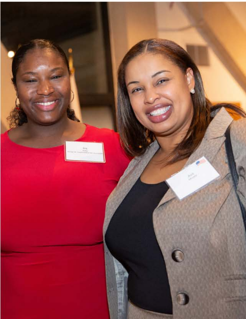
Table Sponsorship and Tickets